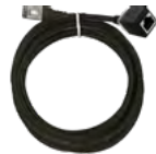
XEC-4.5 4.5 meter Extension interface cable. Order when the radio is trunk mounted. Connects to supplied XIC-1.5 interface cable.(optional)