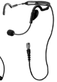
WPHFH-X10 Headset Industrial lightweight