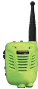
XCFC Custom Front Cover option