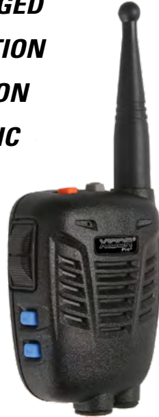
X10DR Pro Plus Handset