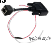
1 x XCA-** Radio adaptor (Required but NOT included) ** refer price list for currently available radio adaptors