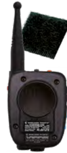
XVMC Velcro® shoulder mount option with sew-on Velcro patch Suit Electrical utilities