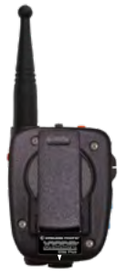
XNMC Non-metal rotary shoulder mount clip - Suit Electrical utilities