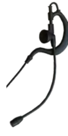
WPULH-X10 Headset Ultra-lightweight earhook style