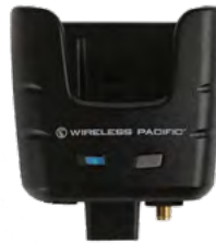
X10DR Pro Plus Gateway