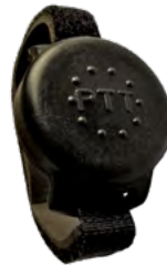
X10DR XWPB Wireless PTT Button